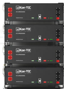
Stacked / rack mounting