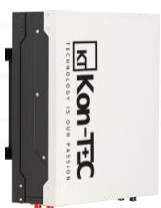
Mounting on the wall