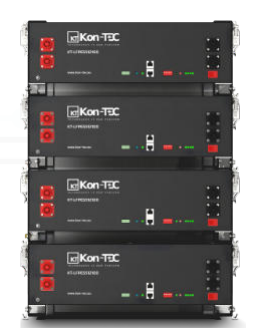
Stacked / rack mounting