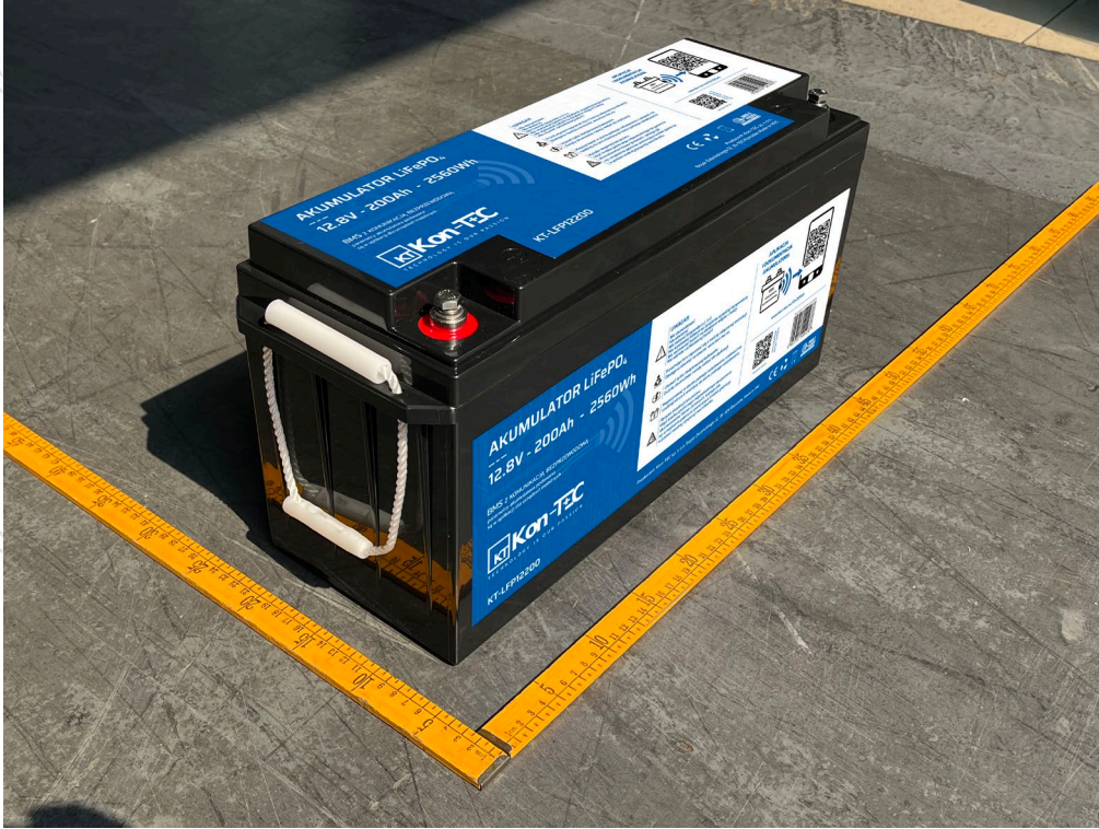
Figure 1 Overall view I of battery (外观图I)