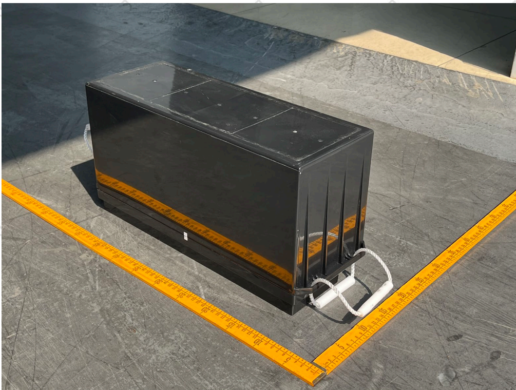
Figure 2 Overall view II of battery (外观图II)