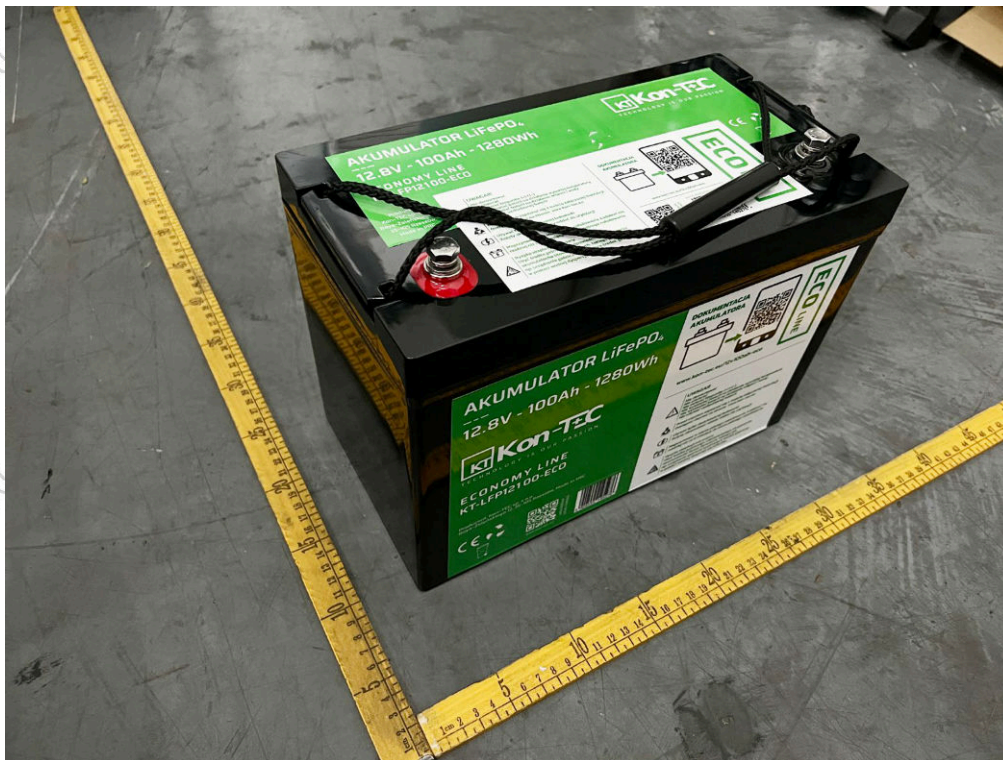
Figure 1 Overall view I of battery (外观图I)